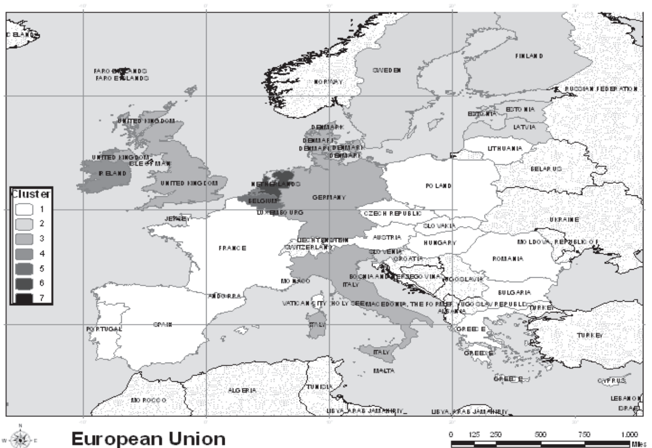
Fig. 3. Cluster for EU membership by each country.

In summary, different patterns of behaviour can be found among EU countries for atmospheric indicators that impact the environment (Fig. 3). Among the clusters formed by a single country, the case of Malta stands out because of its bad records: the population density is high, and emissions of sulphur oxides, nitrogen oxides, ammonia, and other compounds are extreme. A similar