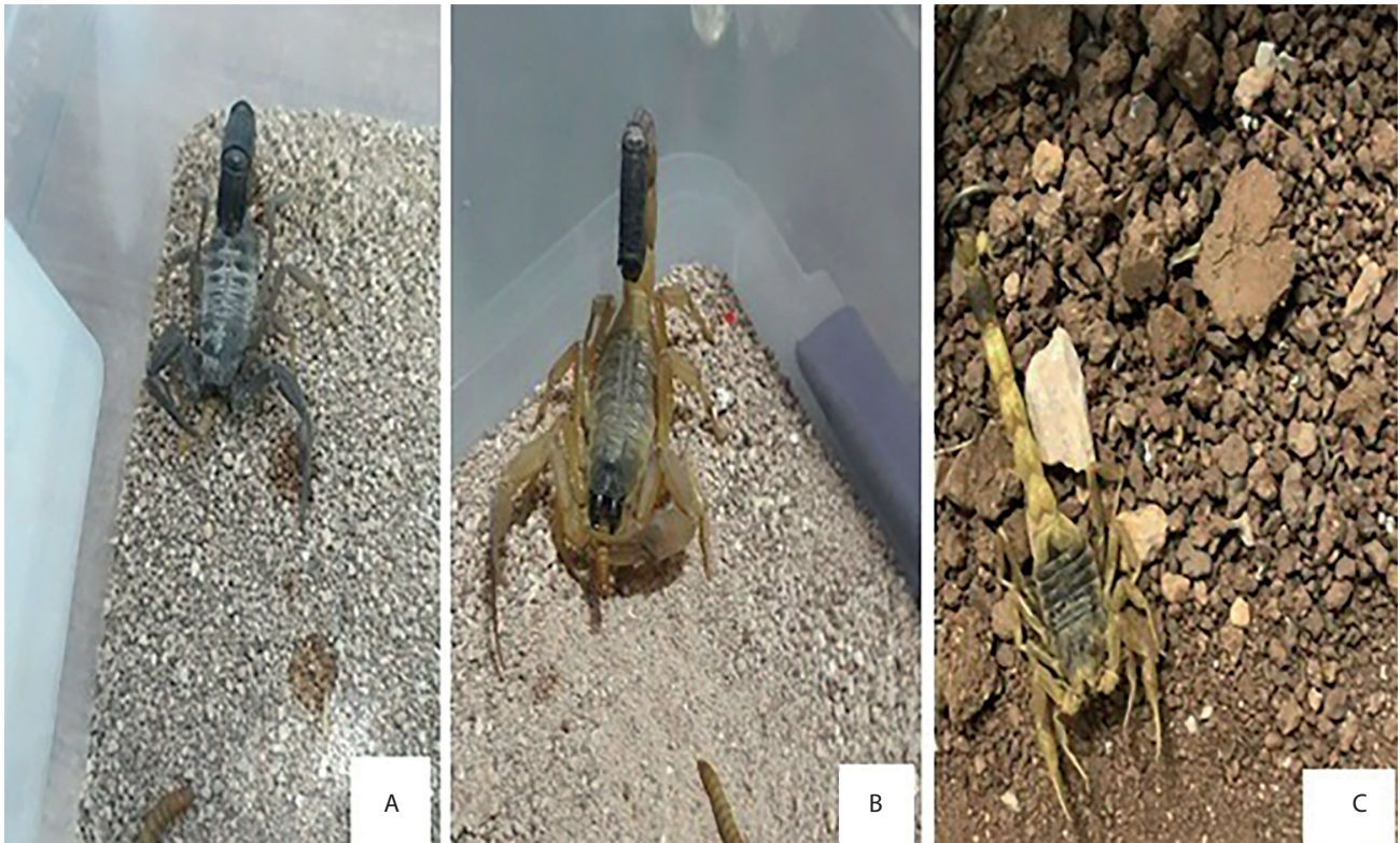
Fig. 1. Adaptation of samples collected from the field in the laboratory environment (A: A. crassicauda , B: H. saulcyi , C: L. abdullahbayrami ).