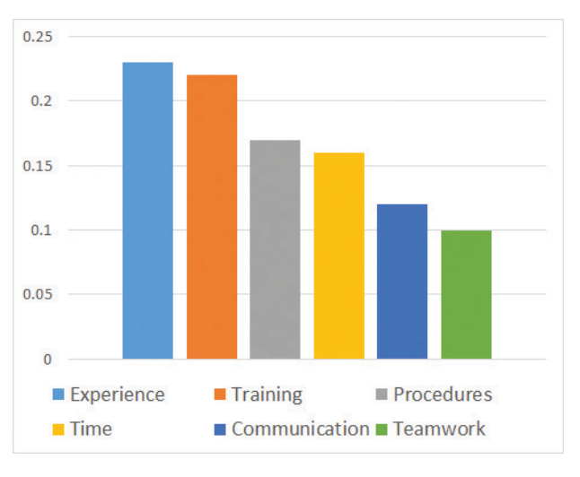
Fig. 3. Normalized PSF values.

Considering the aforementioned, the most common cause of human errors is insufficient knowledge about how exactly the work operations should be performed. Thus, it can be concluded that additional training of analysts, the implementation of new and more detailed procedures, and better time (workload) management could be useful corrective measures that would lead to a reduction of human error in the analysis of polluting