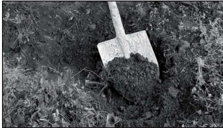
Fig. 2. Field soil sample.