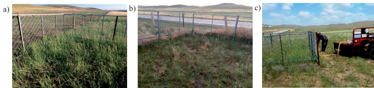
Fig. 1. Pictures of experimental plots and irrigation methods. a) the plot of Leymus chinensis grassland, b) the plot of Stipa krylovii grassland, c) the way of flooding irrigation.

Carex duriuscula . Both grassland types exhibited chestnut soils.