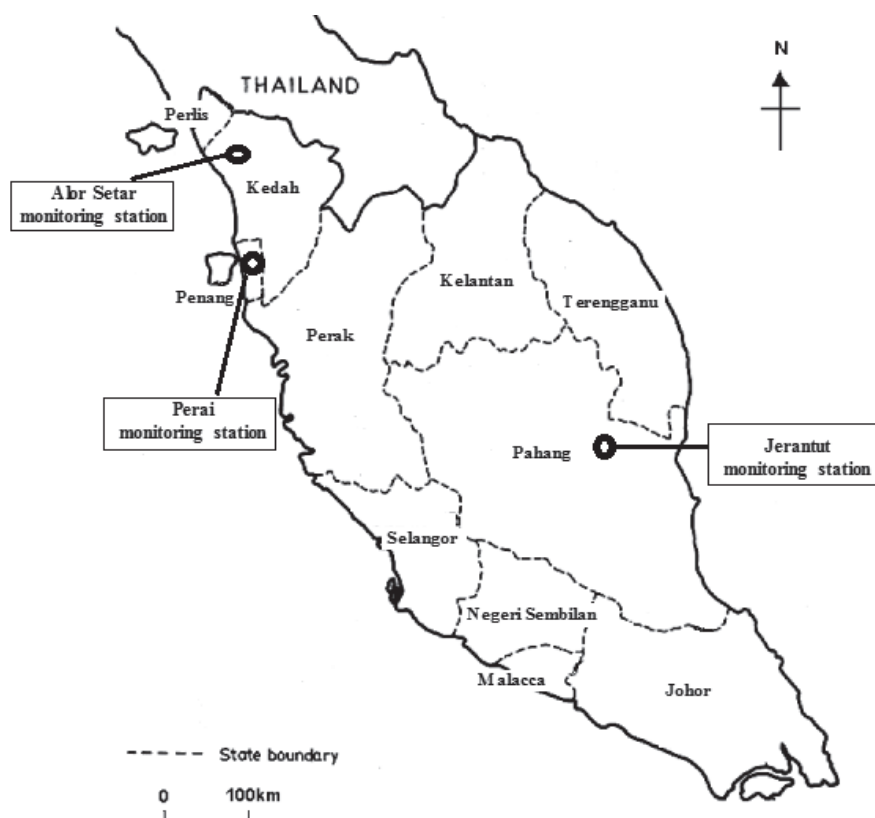
Fig. 2. Location of the selected monitoring stations.

The Department of Environment, Malaysia (DOE) is the responsible agency that monitors the country's air quality. As a part of Malaysian Continuous Air Quality Monitoring (CAQM) program, the O_3 concentration was recorded using Teledyne O_3 Analyser Model 400A UV Absorption. There were two sets of O_3 concentration data utilised in this study. Firstly, the hourly average data set from January 2006 to December 2017 were used for descriptive statistics to examine the behavior pattern of O_3 concentration. Secondly, the hourly data